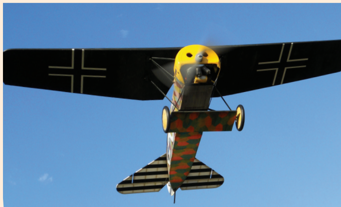
Fokker DVII 38" span