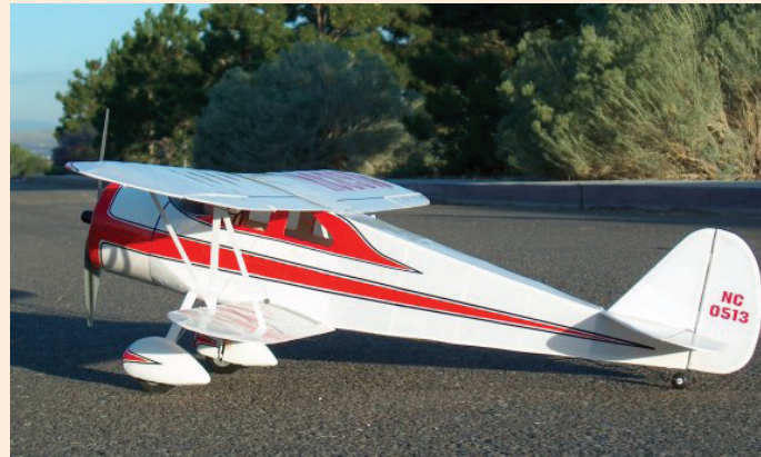
Waco SRE 38" span