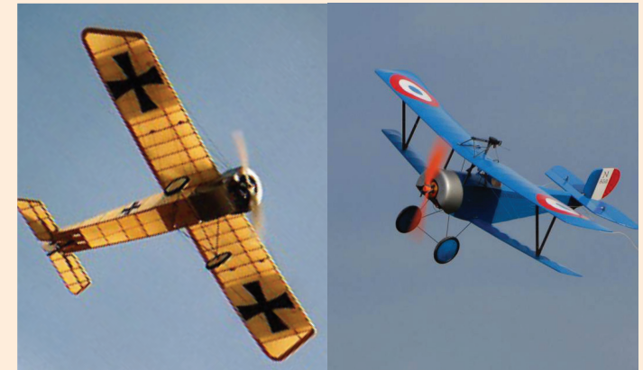
Combat Duo Twin Pack