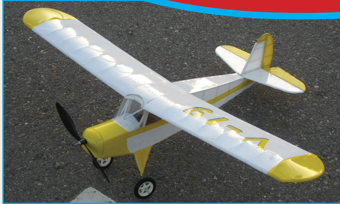
Aeronca Defender 42" span