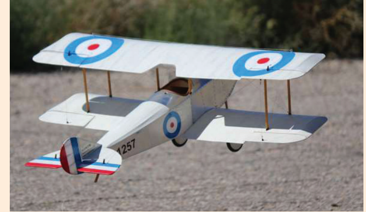
Sopwith Tabloid 38" span