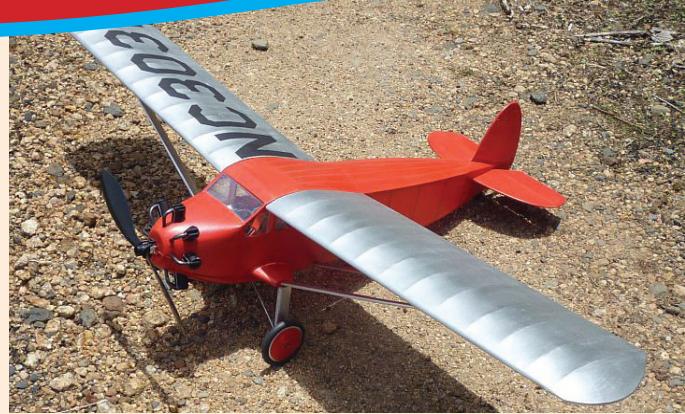
Verville Air Coach 42" span