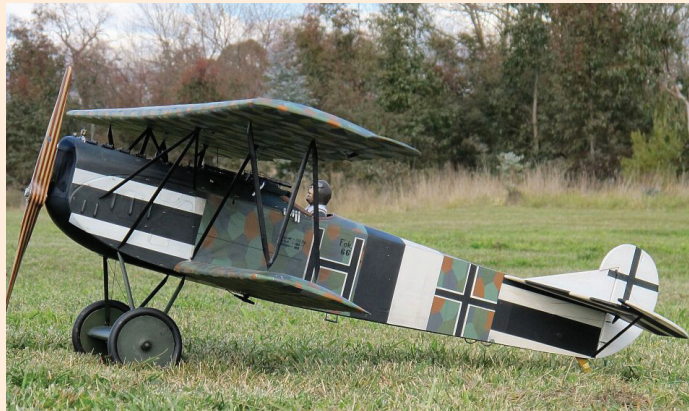
Fokker DVII 38" span