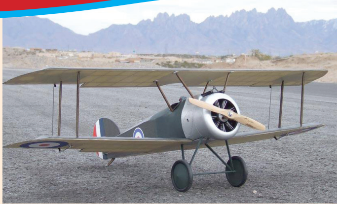
Sopwith Camel 36 inch span