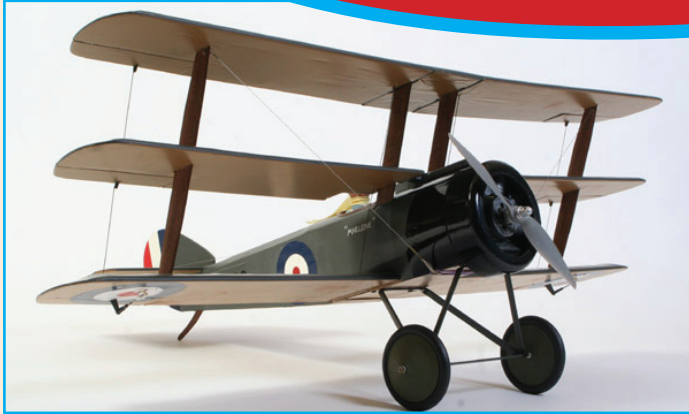
Sopwith Triplane 36" span

Our new range of electric scale models has been designed exclusively for Belair Kits by Peter Rake and suit 400 size brushless motors and mini radio equipment. The detailed plans are CAD drawn ensuring the highest accuracy and the all wood traditional construction builds into a lightweight, strong airframe. All designs are proven designs with good flying characteristics.