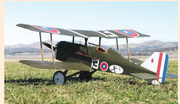
SE5a 36" span