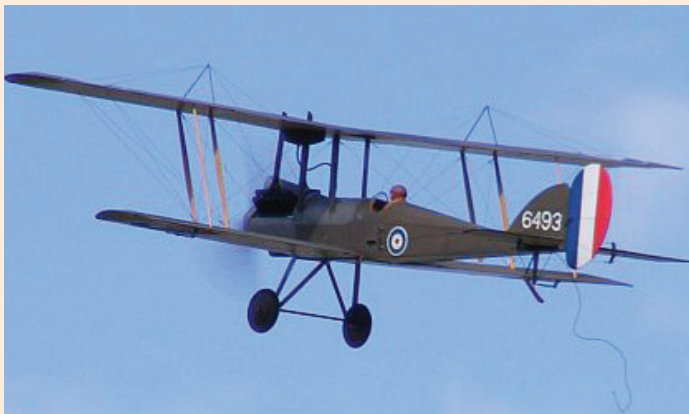
BE2e/Be12a 36" span