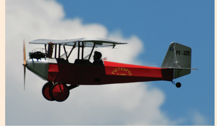
Pietenpol 36" span