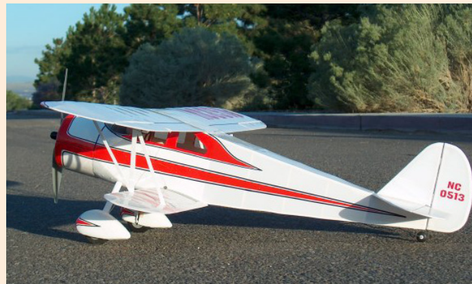
Waco SRE 38" span