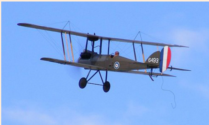
BE2e/Be12a 36" span